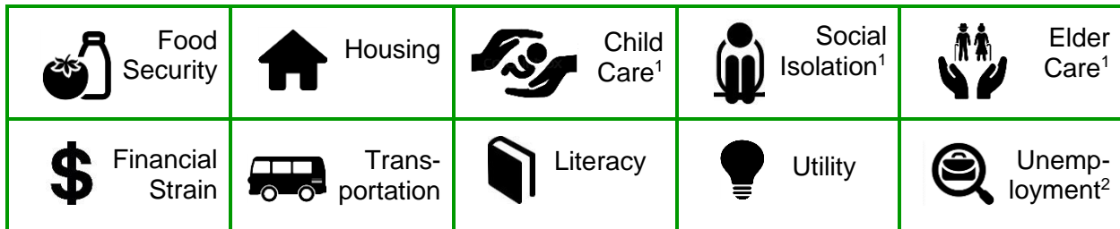
Percent of Total Positive Screens for Social Needs, by Institution